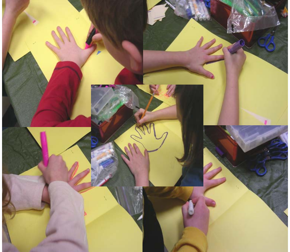
Helping Hands! Two groups of children attended the "Bee...ing Together" Social Skills workshop that were held at Exeter Public School throughout February and March 2011.

Over the 6 sessions the youngsters had a great time sharing their ideas and joining in on the social interaction.